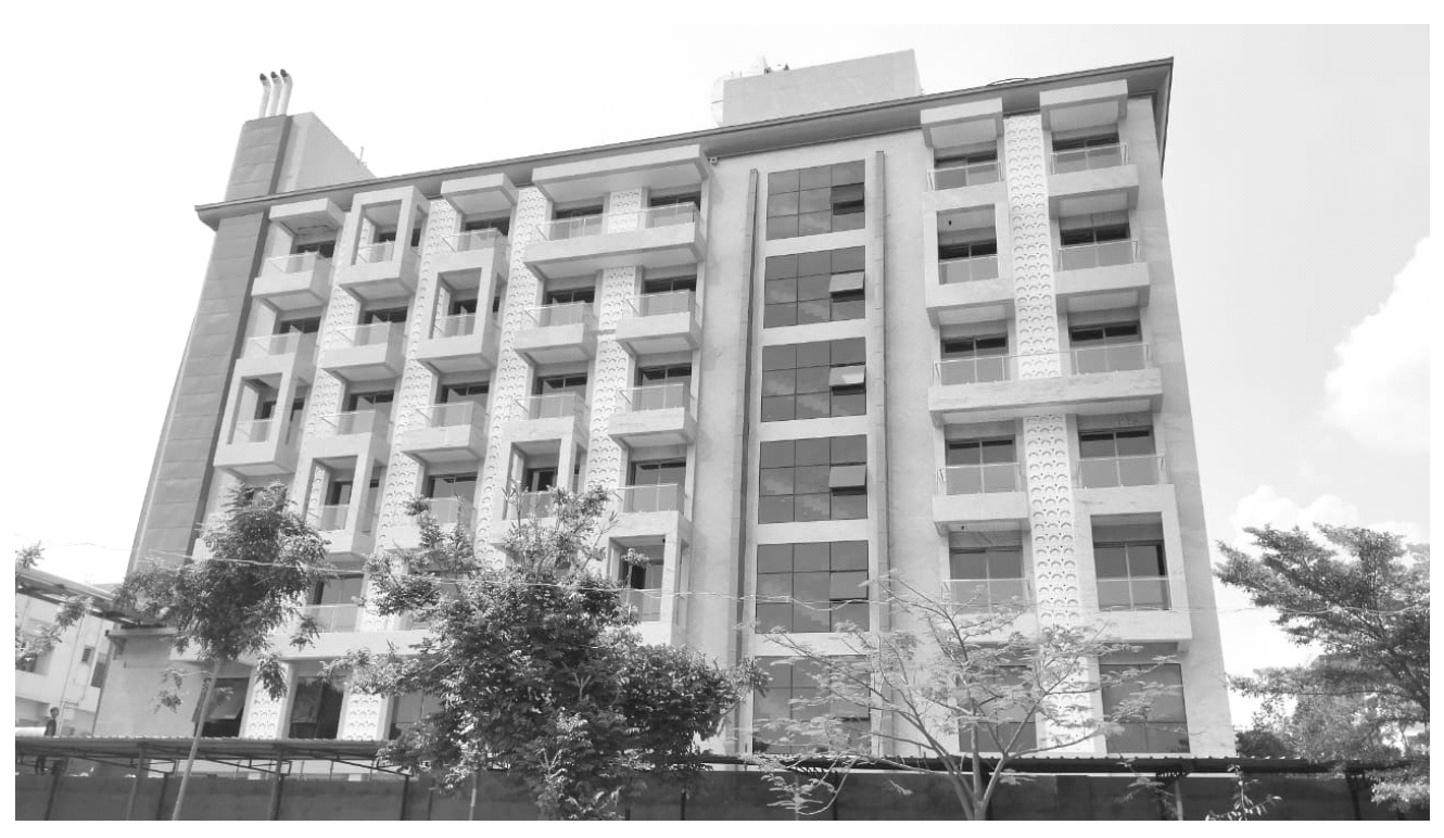
Institutional Building for M/s C.I.S.C.E -Council for the Indian School Certificate Examination (Regional Institute) at Habsiguda, Hyderabad