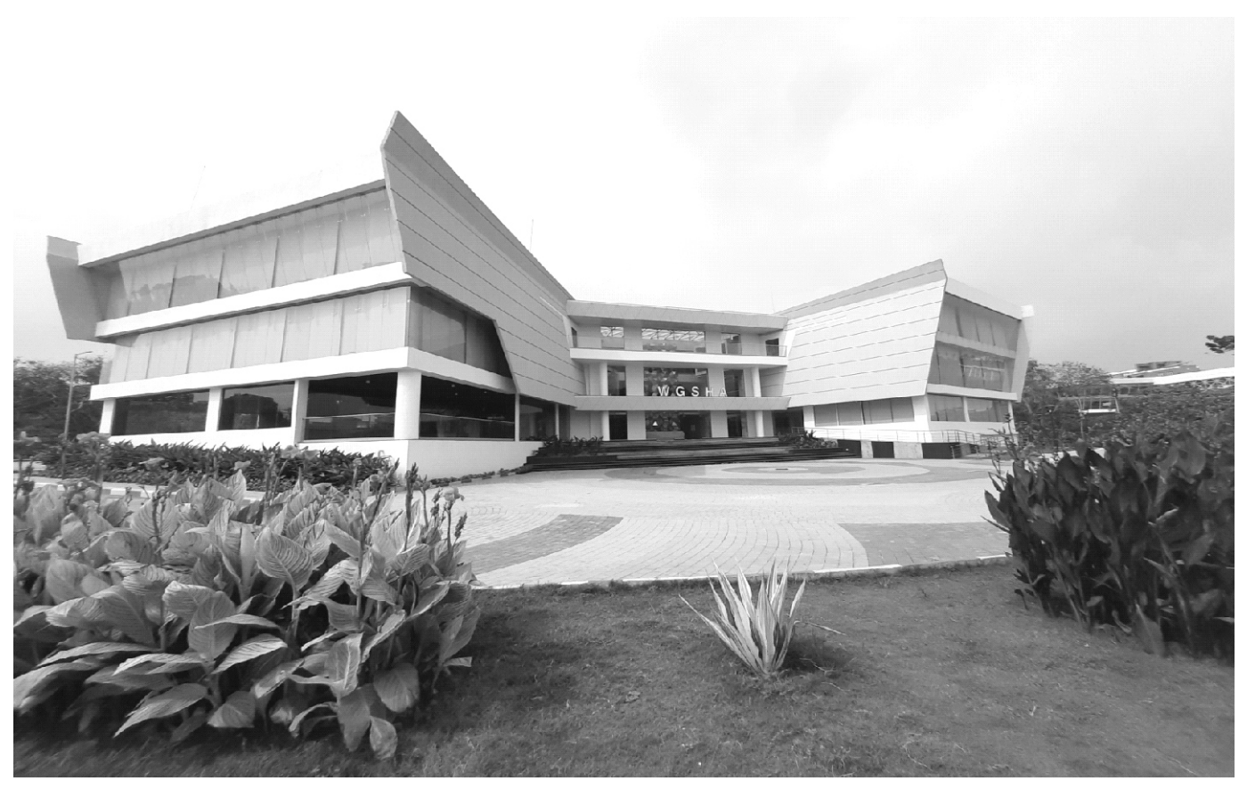
(Welcome Group School of Hotel Administration – WGSHA) Academic block building for M/s Manipal Academy of Higher Education at Manipal, Karnataka.

▶ CREATIVE ▶ COMMITTED ▶ CUSTOMER FOCUSED