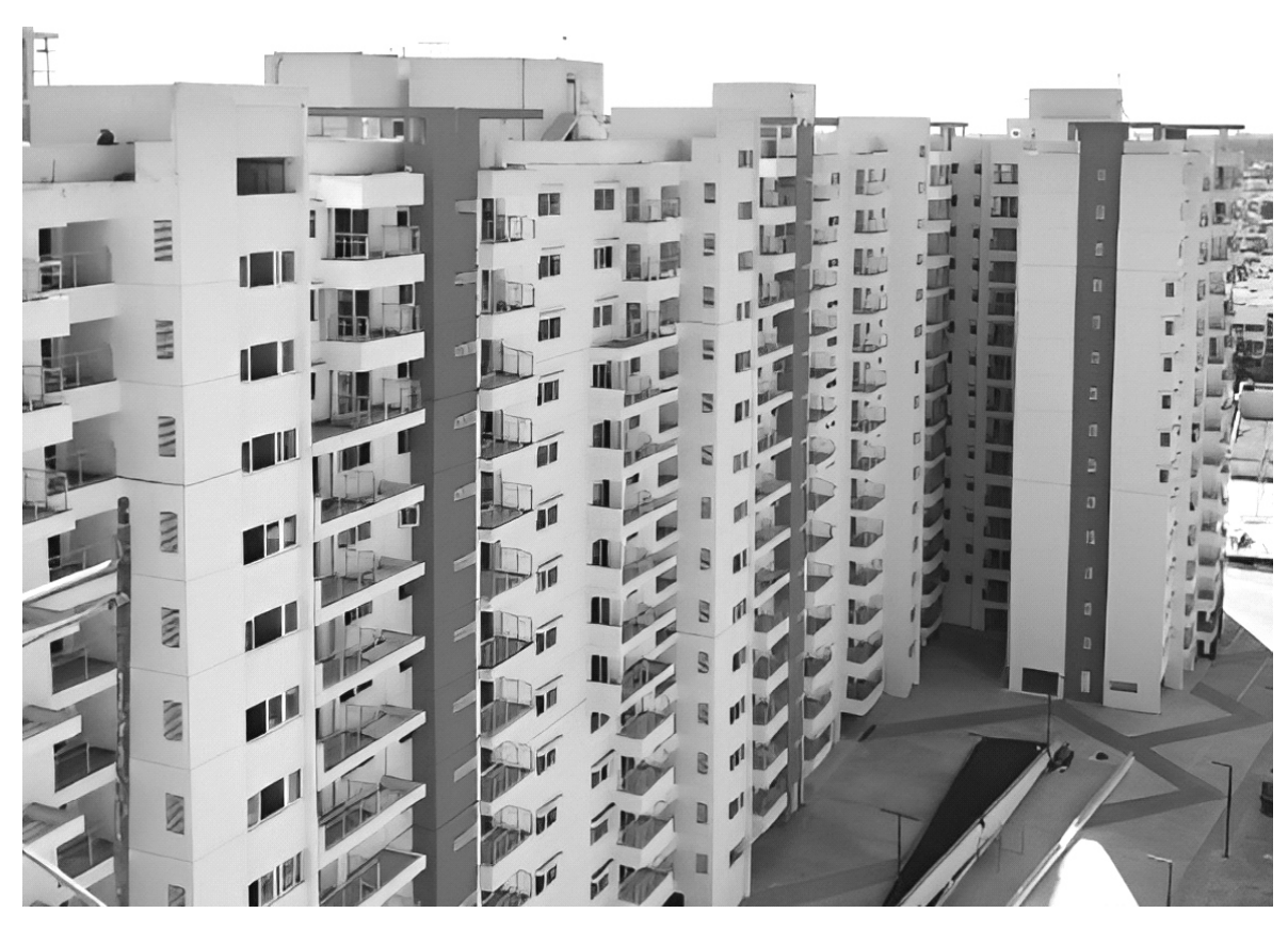
Sattva Navaratna Residency Apartments for M/s Sattva Group at Coimbatore, Tamil Nadu.