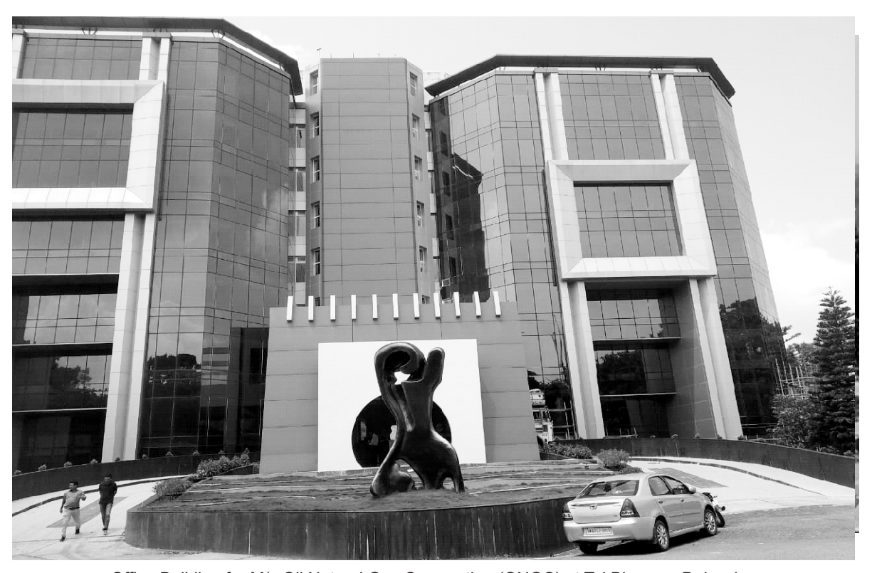
Office Building for M/s Oil Natural Gas Corporation (ONGC) at Tel Bhawan, Dehradun