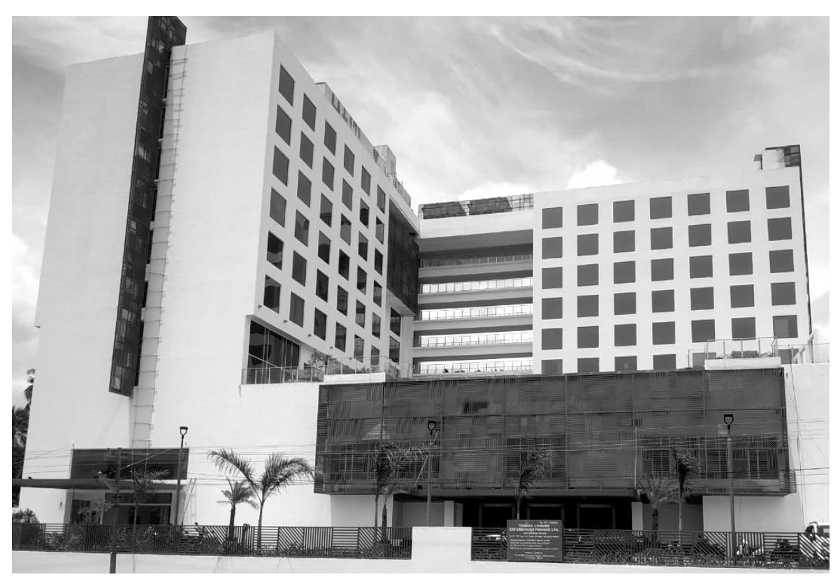
Hotel Building and Convention Centre for M/s TAMARA at Trivandrum, Kerala