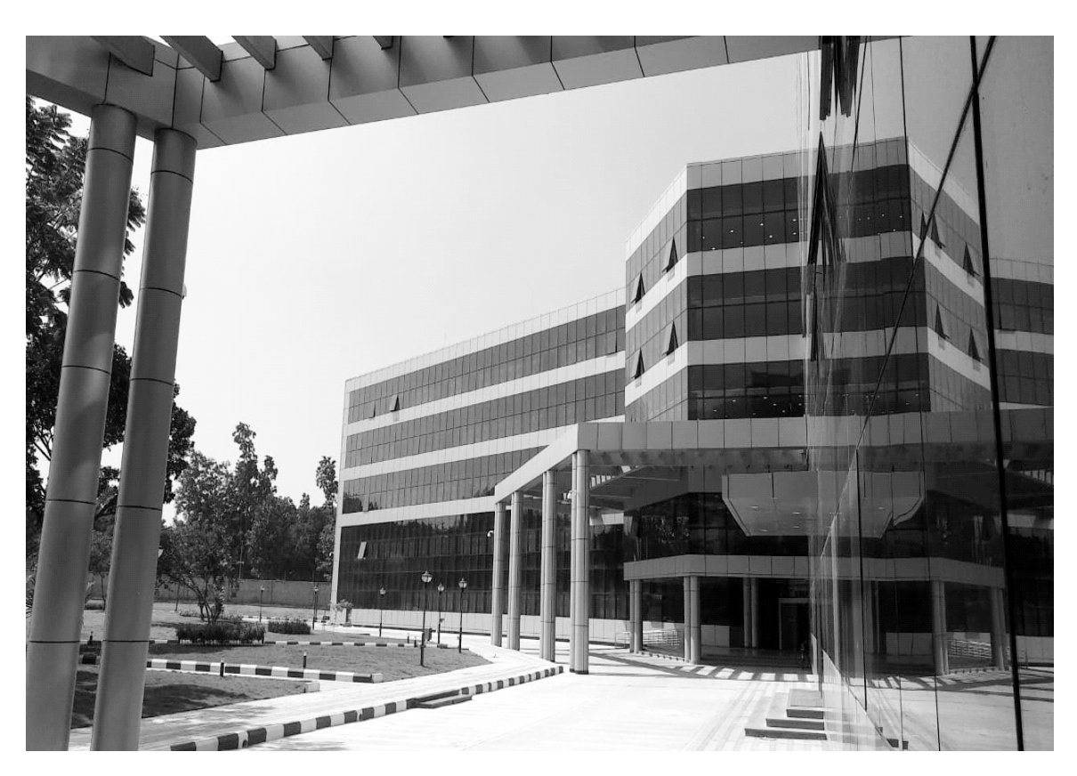
PDIC Centre Building for M/s Bharat Electronics Limited at Bengaluru, Karnataka