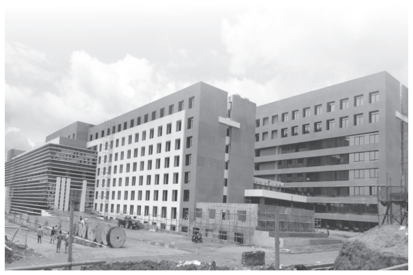
International Student Centre and Lecture Hall for M/s Xavier University (XUB) at Bhubaneswar, Orissa

▶ CREATIVE ▶ COMMITTED ▶ CUSTOMER FOCUSED