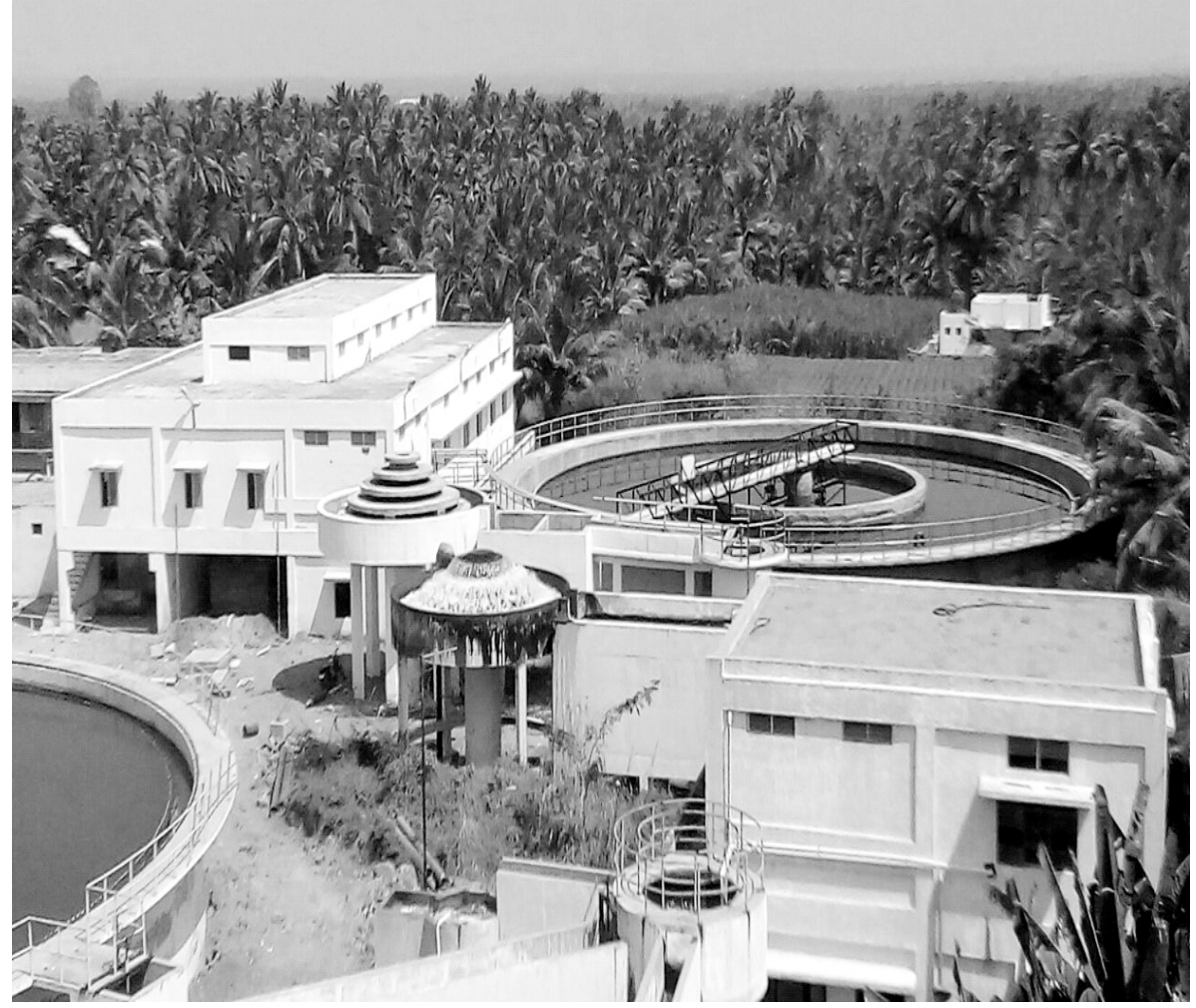
Water Supply Scheme to 528 Rural Habitations, Vellakoil and Kangeyam Municipalities for M/s TWAD at Tamil Nadu