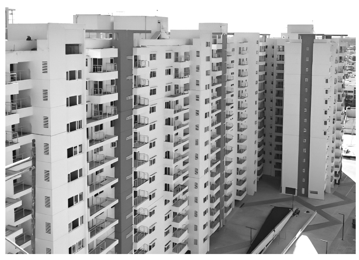
Sattva Navaratna Residency Apartments for M/s Sattva Group at Coimbatore, Tamil Nadu.