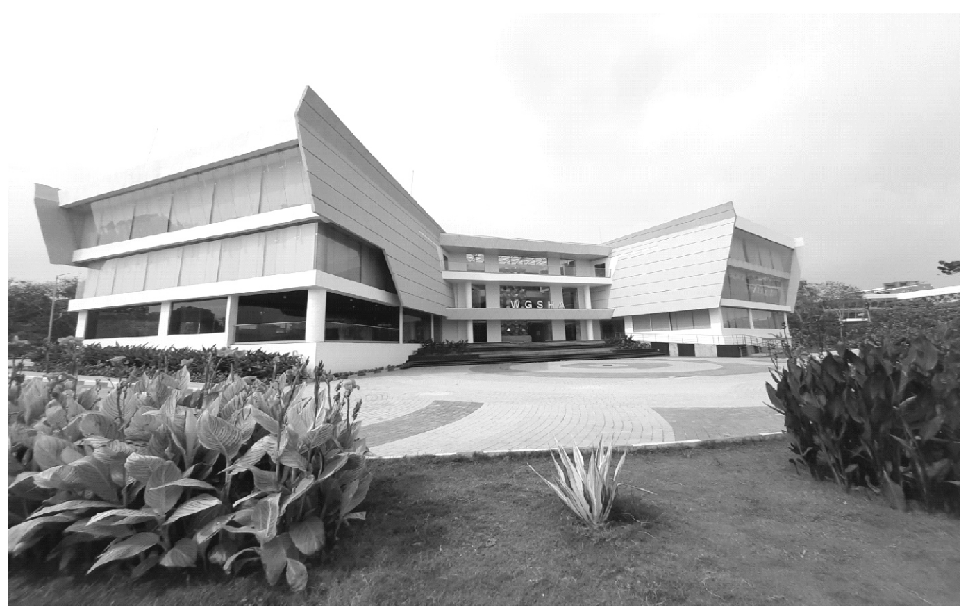
(Welcome Group School of Hotel Administration – WGSHA) Academic block building for M/s Manipal Academy of Higher Education at Manipal, Karnataka.

▶ CREATIVE ▶ COMMITTED ▶ CUSTOMER FOCUSED