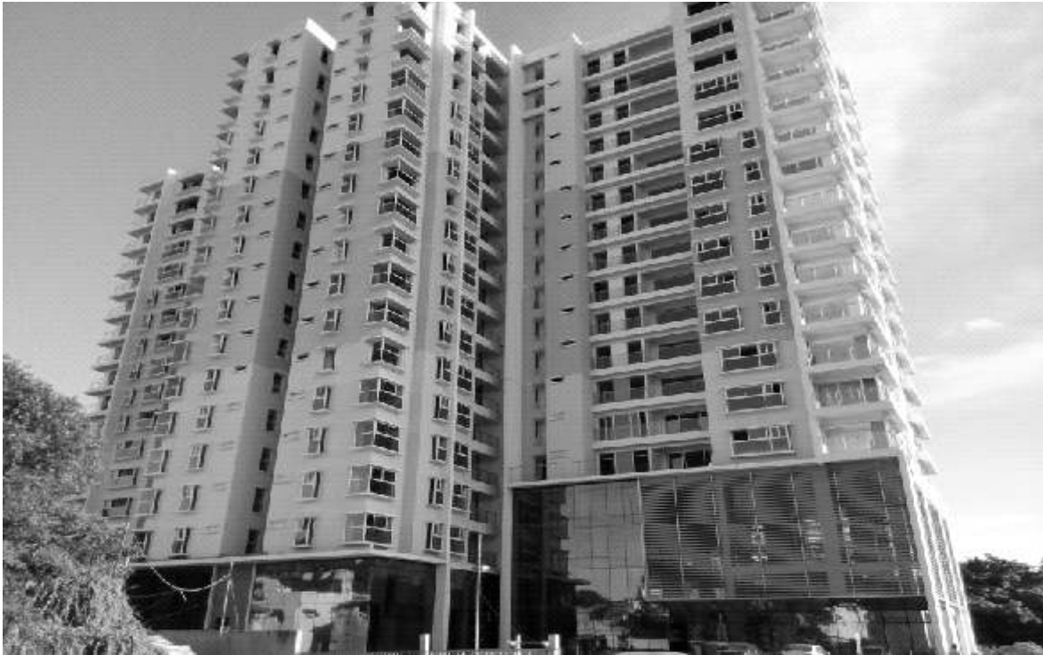
"TVH Quadrant – Multistoried" for True value Homes (I) Pvt Ltd, LB Road, Adyar, Chennai