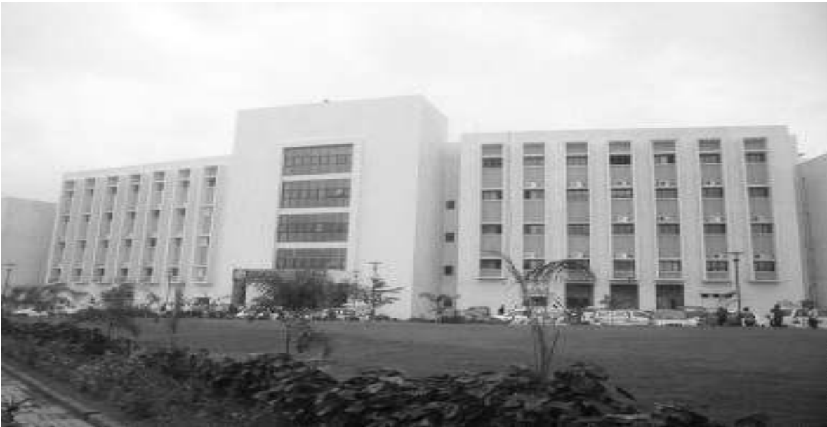
“Medical College Complex” for Ministry of Health & Family Welfare (AIIMS), Bhubaneswar