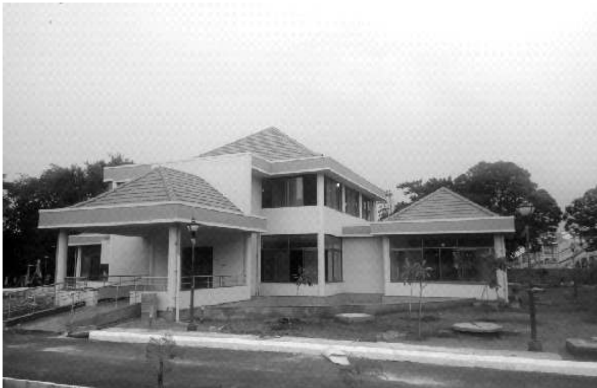
"Training Centre" for Bharat Electronics Ltd, BE Estate, Bangalore