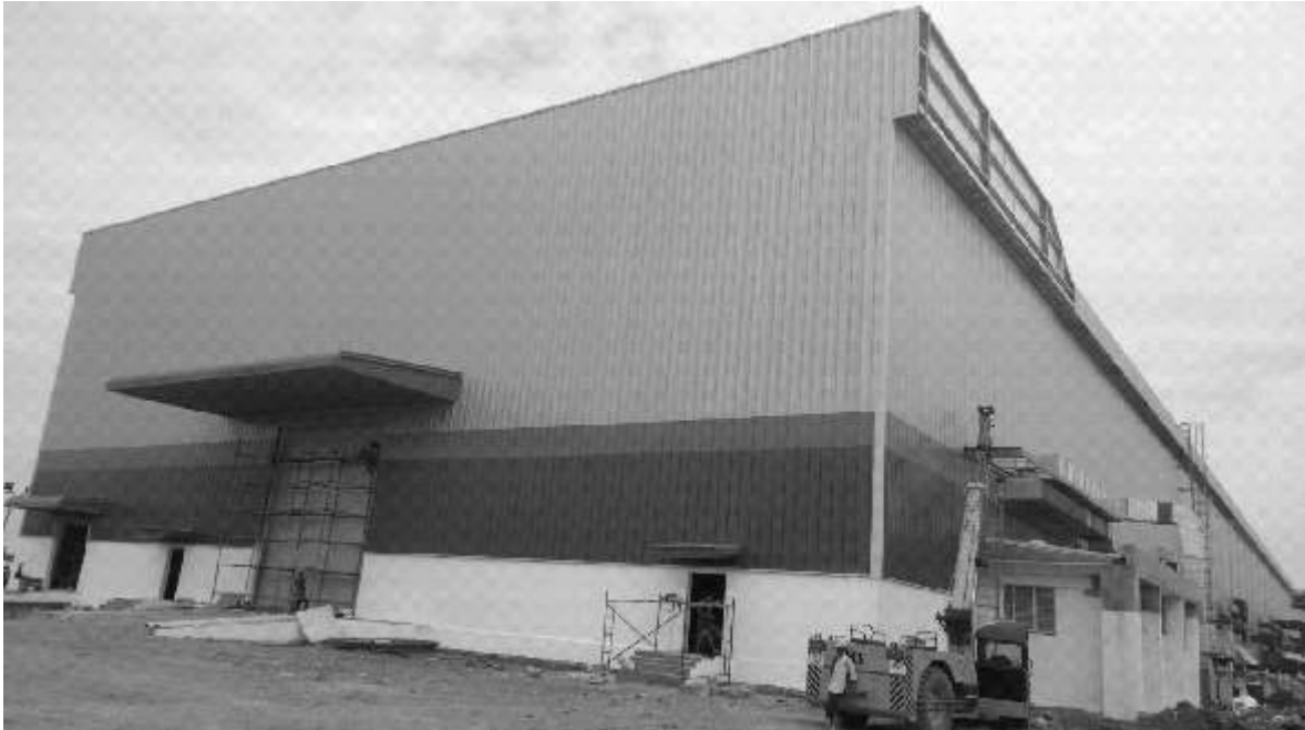
“Gamesa G122 Blade Plant” for Gamesa Renewable Private Limited, in SPSR Nellore