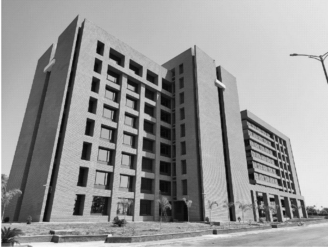
1000 Students Hostel Building for M/s XIM University at New campus, Bhubaneswar, Odisha