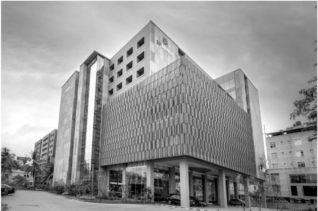
500-bedded SP Medifort multi specialty hospital for M/s SP Hitech Ventures at Eanchakkal, Thiruvananthapuram, Kerala

▶ CREATIVE ▶ COMMITTED ▶ CUSTOMER FOCUSED