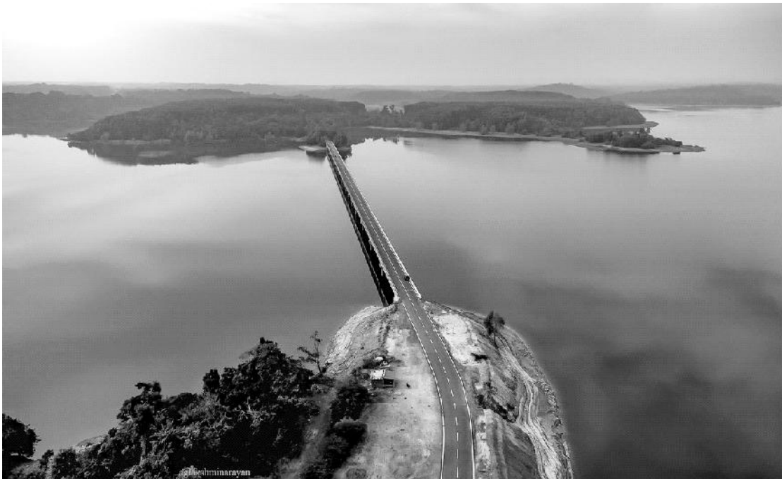
Construction of Bridge at Sagar Pattaguppa Road in Hosanagar Taluk in Shimoga District