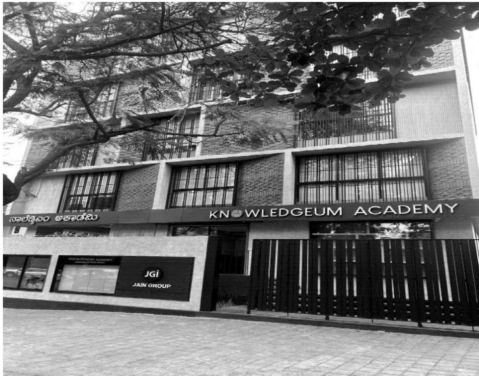
Commercial Building for M/s Sumo Group at Jayanagar , Bengaluru, Karnataka