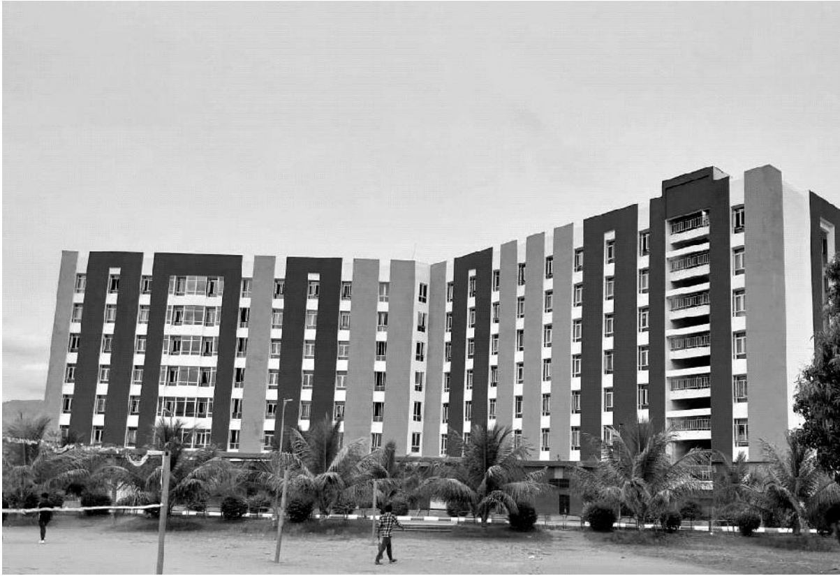
Construction of Y Block Hostel Building for Sree Vidyanikethan Educational Trust at Sri Sainath Nagar, Tirupati, Andhra Pradesh.